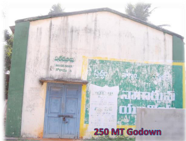
250 MT Godown